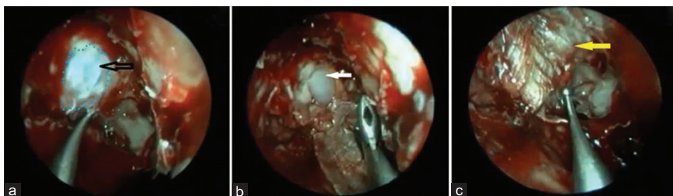
Endoscopic view. (a) Defect in the posterior table of the frontal sinus marked with blue dots and black arrow points to the dura; (b) white arrow points to cartilage graft applied between the dura and the bone; (c) yellow arrow indicates on-lay fascia lata graft.