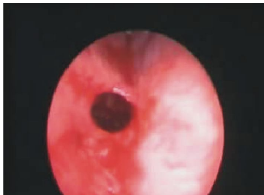
Fig 2. Endoscopic picture of patent RT choana after removal of the stent.

First group: In 4 patients the case remained patent after surgery (Fig. 2).