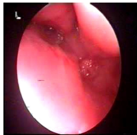
Fig 3. Endoscopic view of the LT choana with restenosis and polyp formation.

Two patients developed polyp formation, 3 months after removal of the stent for whom revision surgery was done with cleaning of the new choanae (Fig .3).